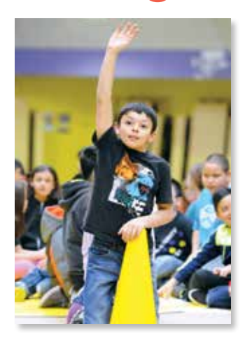
We create a space that is safe, inclusive and welcoming for all.