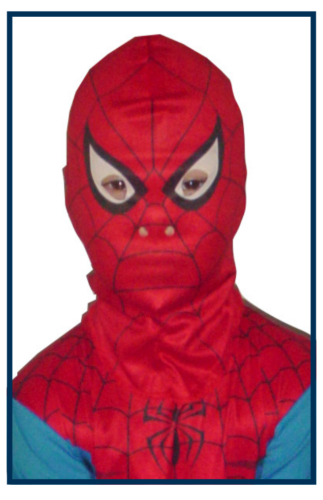
your whole face