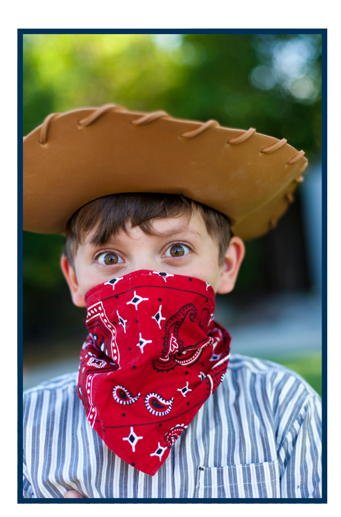
or just your mouth