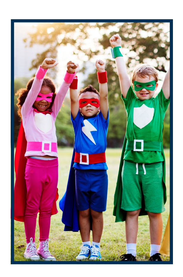
I might wear masks for dress-up, playing with friends, or going to parties.