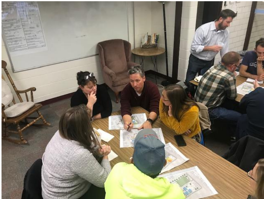
DAG Meeting #2