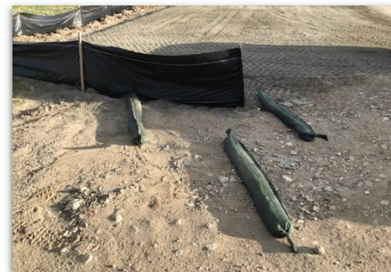
Storm Water Prevention