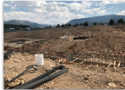
Continued Form and Rebar Installation