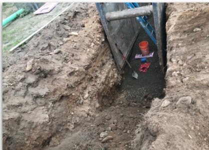
Continued Utility Installation