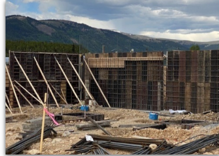
Wall Formwork/Rebar Installation