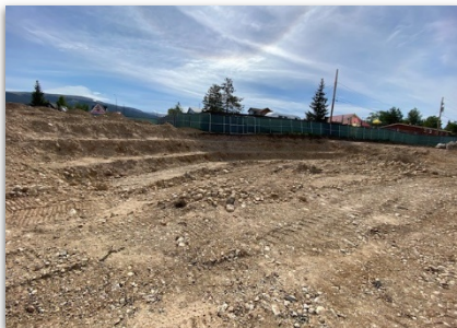
New ECE Grading