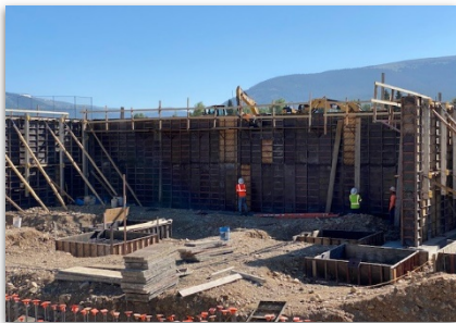
Wall Formwork/Rebar Installation