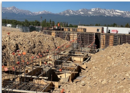
Footing Formwork/Rebar Installation