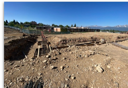
Footing Formwork/Rebar Installation