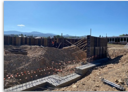
Wall Formwork/Rebar Installation