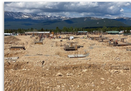
Form Area A Walls and Pads