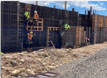
Form Area A Walls