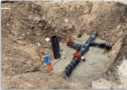
Underground Water Line Install