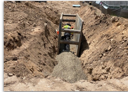
Underground Water Line Install