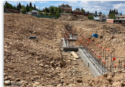
Strip Area B Forms