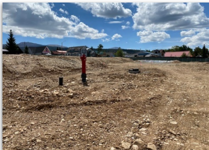
Fire Hydrant Install