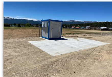
Water Fill Station Relocation