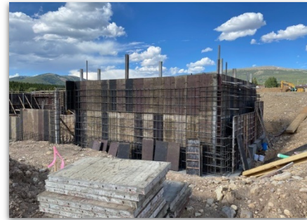
Wall Formwork/Rebar Installation