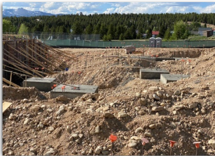
Pour Area A Footings