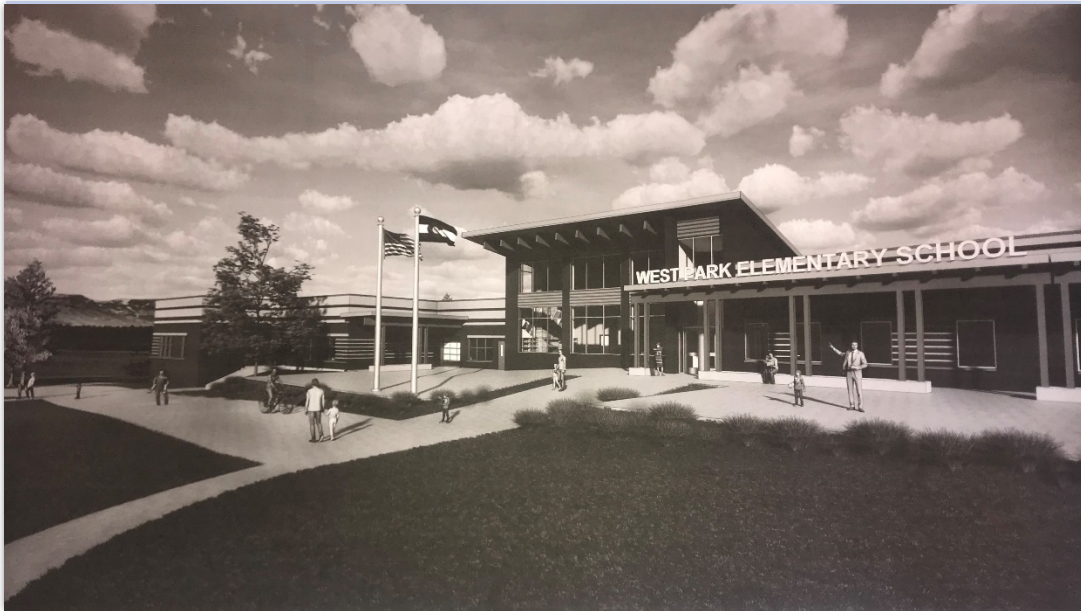
West Park Elementary - Site Capture

Report Number 7 Week of 7/4/20 - 7/10/20 Superintendents: Austin Liesmer, Larry Yeager Author: Jarred Collom