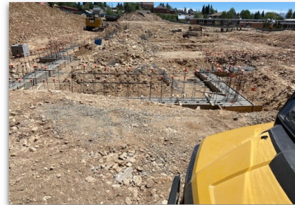
Pour Area B Footings