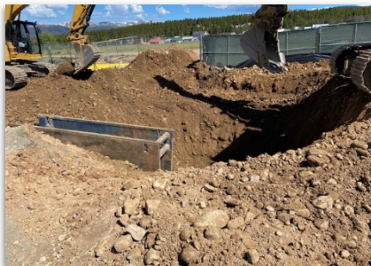
Underground Utility Installation