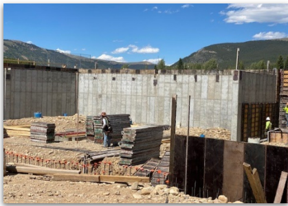
Pouring Basement Walls