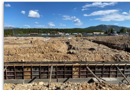
Underground Utility Install and Form Area B Walls