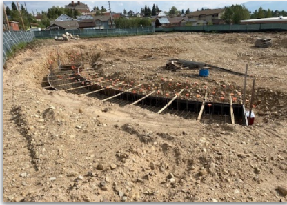
Form Outdoor ECE Classroom