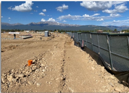
Curb and Gutter Prep