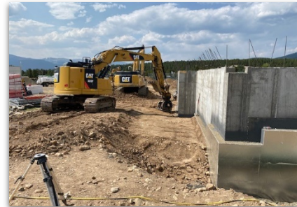
Backfill Foundation in Area A