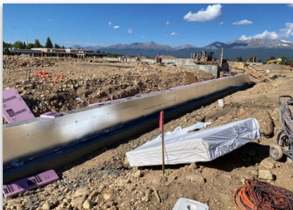
Dampproofing and Waterproofing Area A/B