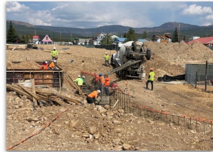
Pour Footing for Retaining Walls