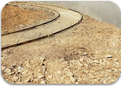
Sidewlk Forms Set @ Existing Playground