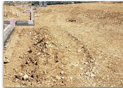
Backfill @ East Side Area B