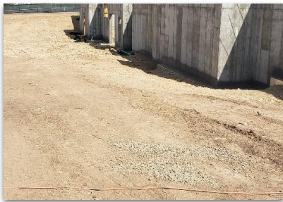
Backfill @ Basement