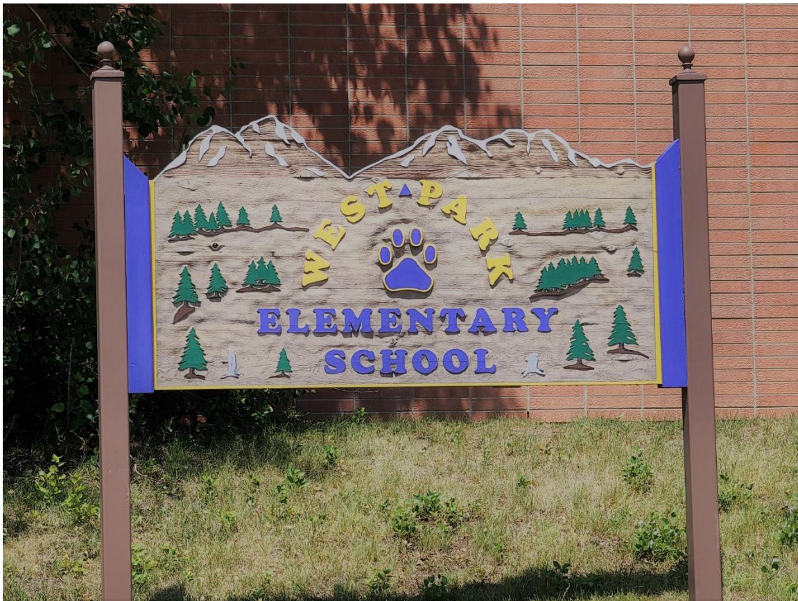
West Park Elementary