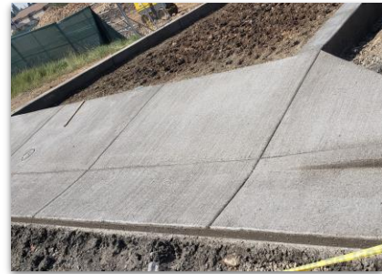
Northeast Entrance Poured