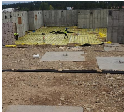
BASEMENT SLAB PREP