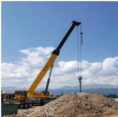
CRANE ON SITE