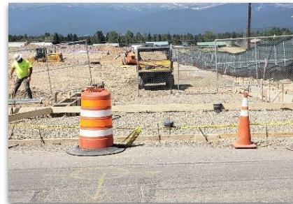
Formwork @ Northeast Entrance