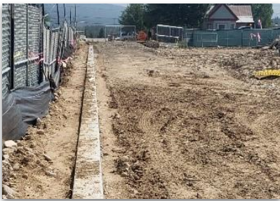
Ribbon Curb @ East Entrance