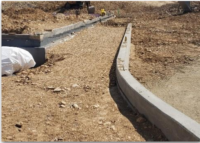
Backfill @ Existing Playground Retaining Wall