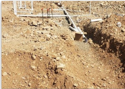
Plumbing Underground @ Area B