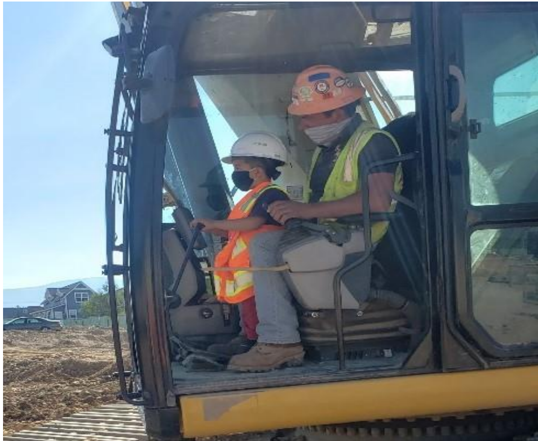
West Park Elementary - FOCUSED!