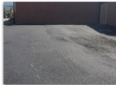
Paving @ Bus Drop Off Entrance