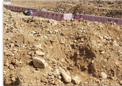
Waterproofing & Insulation @ Area B