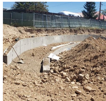
LOWER WALLS @ ECE PLAY AREA