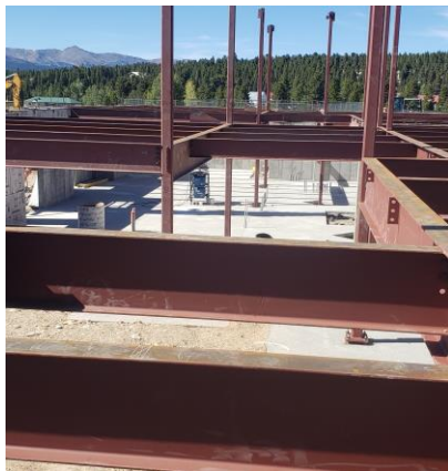
BASEMENT SLAB & IRON ERECTION