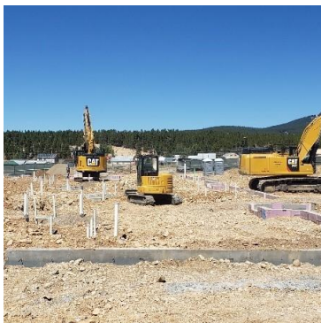
SLAB PREP AREA B