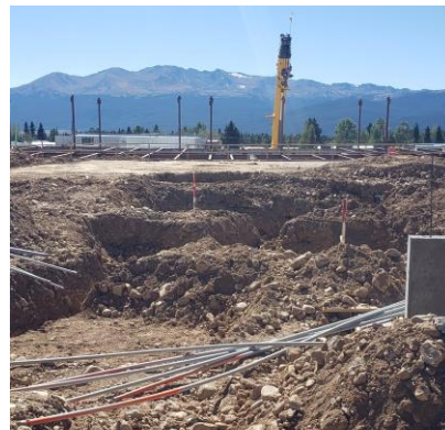
BACKFILL AREA A @ BASEMENT