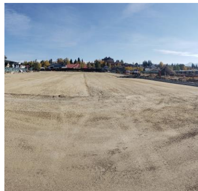
UPPER LOT PAVING PREP