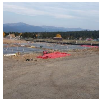
SLAB ON GRADE FINISH (ZONE 6)