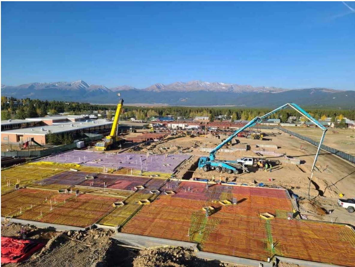
Site Capture #5