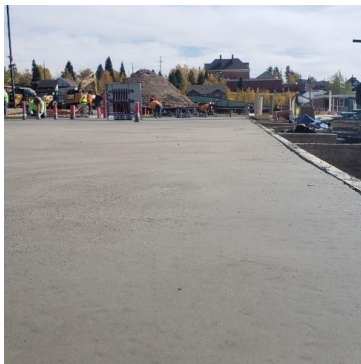
SLAB ON GRADE POUR (ZONE 6)