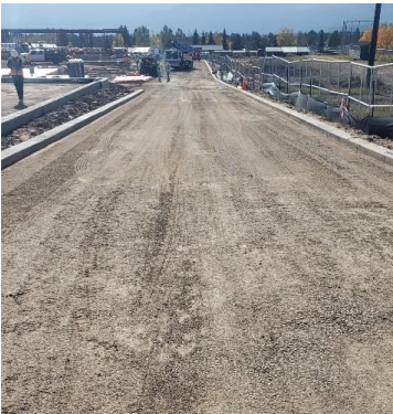
ROADWAY PAVING PREP