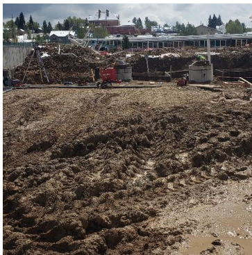
GREASE TRAP BACKFILLED