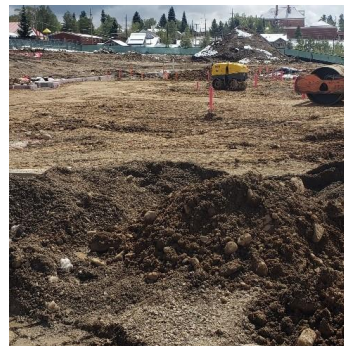
SLAB PREP AREA B