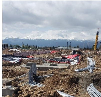
UNDERGROUND UTILITIES & PAD PREP