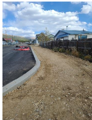
SIDEWALK PREP @ UPPER LOT