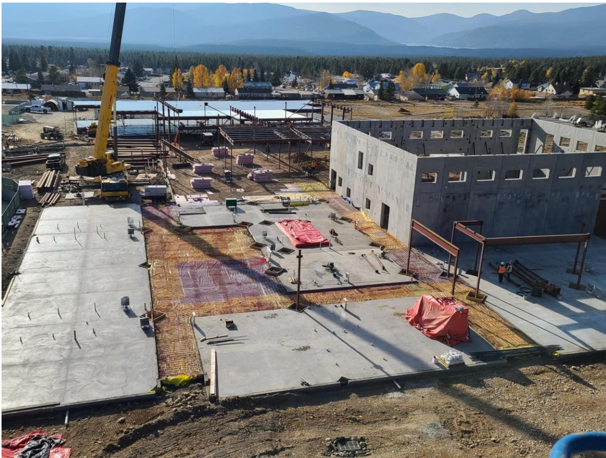
Site Capture #7

Report Number 20 Week of 10/03/20 - 10/09/20 Superintendents: Austin Liesmer, Larry Yeager Author: Larry Yeager