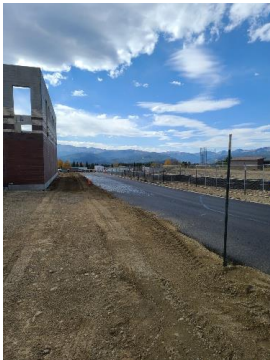
DRIVE LANE PAVING