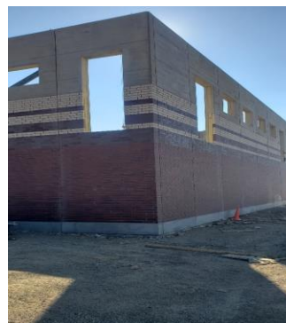
BRICK ON PRECAST PANELS