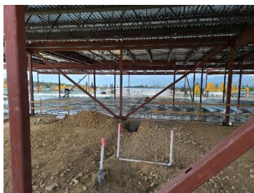
SLAB ON DECK PREP