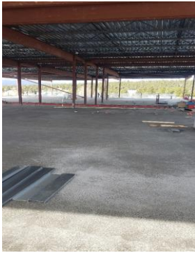
1 st FLOOR ABOVE BASEMENT