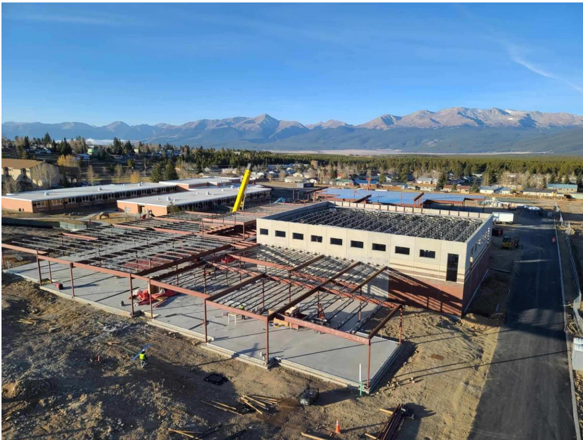
Site Capture #8