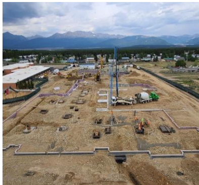
8 WEEKS AGO!