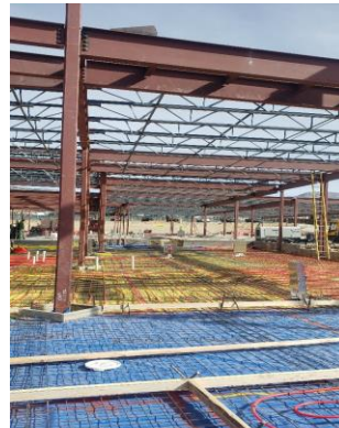
SLAB PREP AREA A