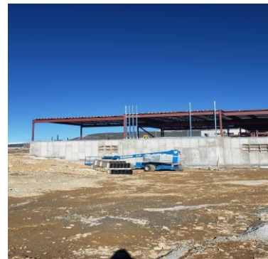
FRAMING @ BASEMENT UPPER LEVEL