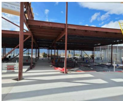
POLISHED CONCRETE POURS