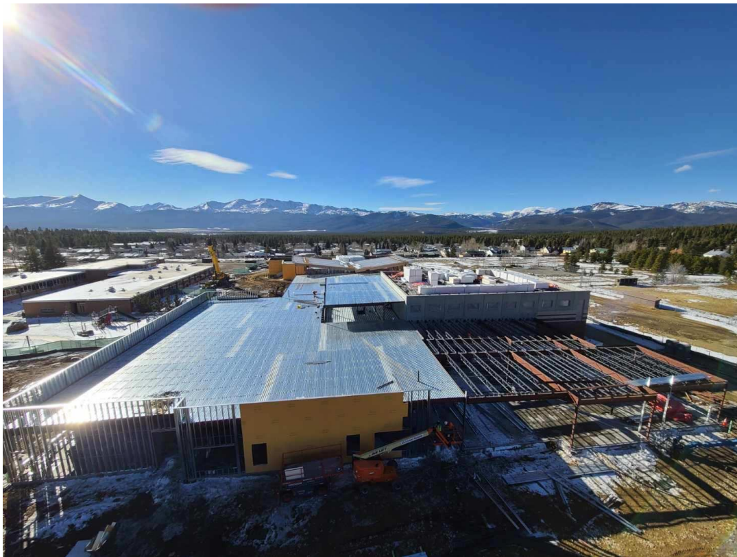
Site Capture #12