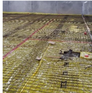
GYM SLAB PREP