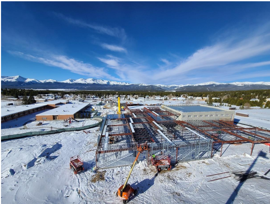
Site Capture #11