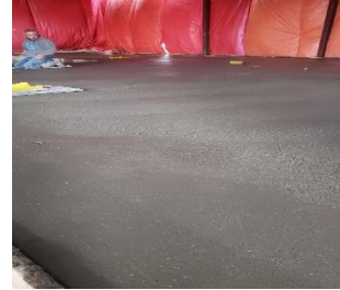
MUSIC ROOM POUR