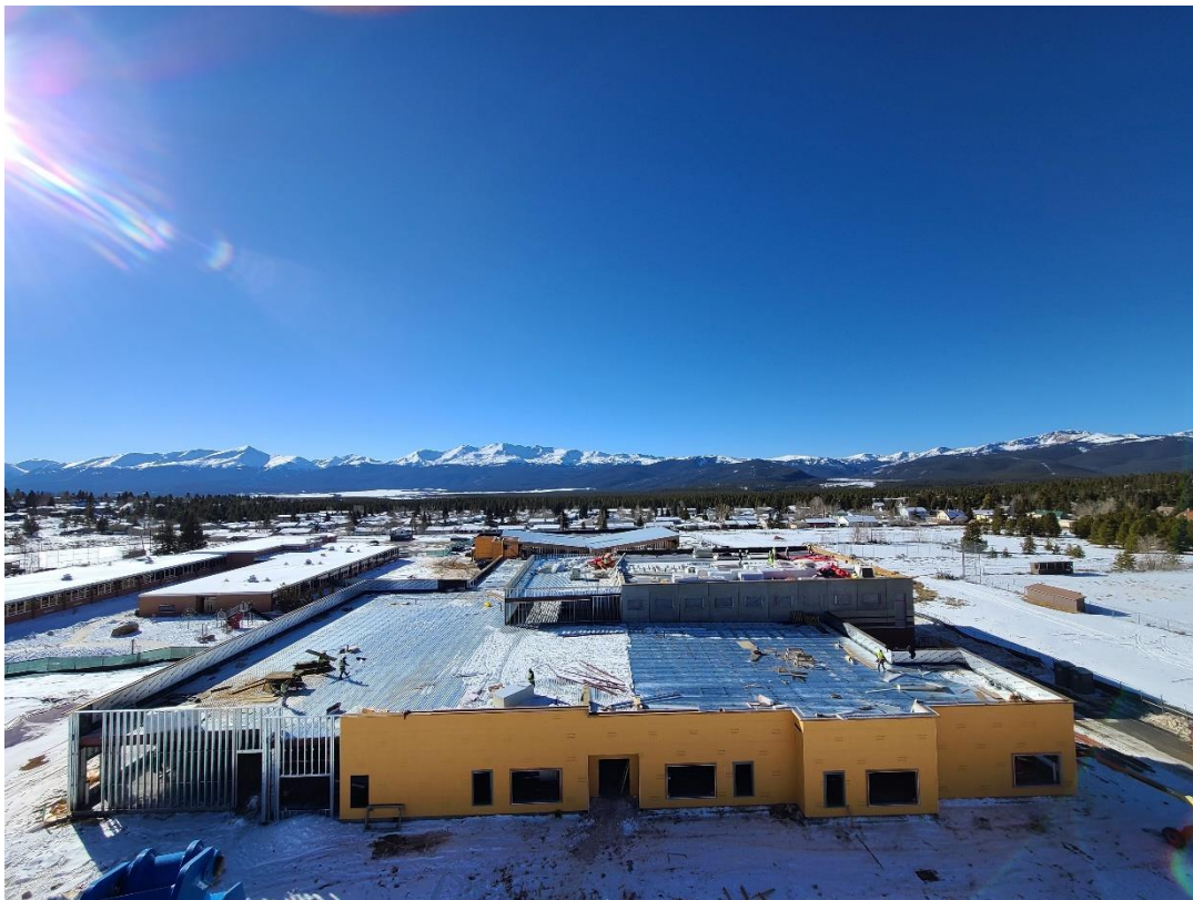
Site Capture #13