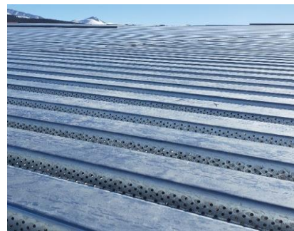
ROOF DECKING @ COMMONS