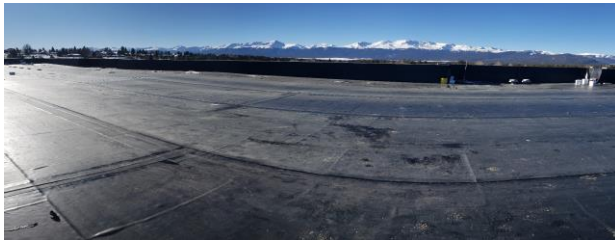
ROOFING AREA A