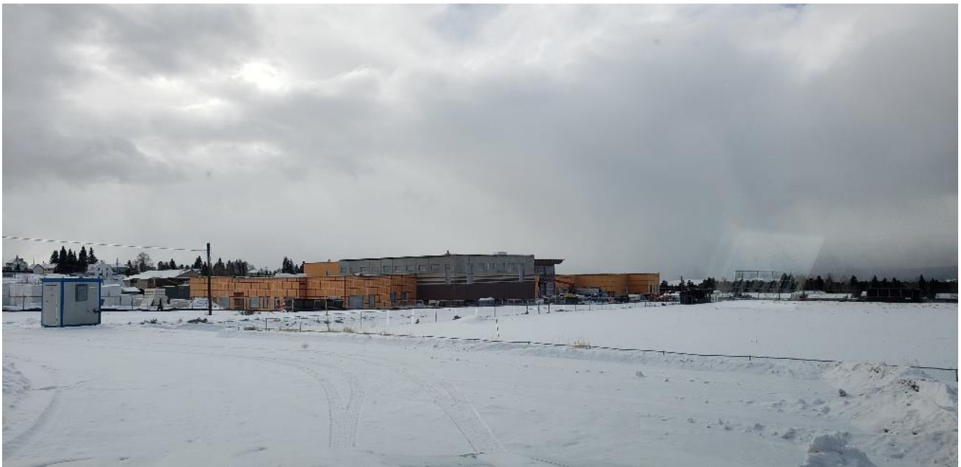
Site Capture #15