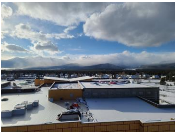
AREA B ROOFING