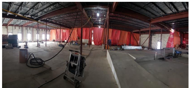
CORRIDOR LOOKING WEST AREA B