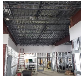
AREA A UPPER DRYWALL