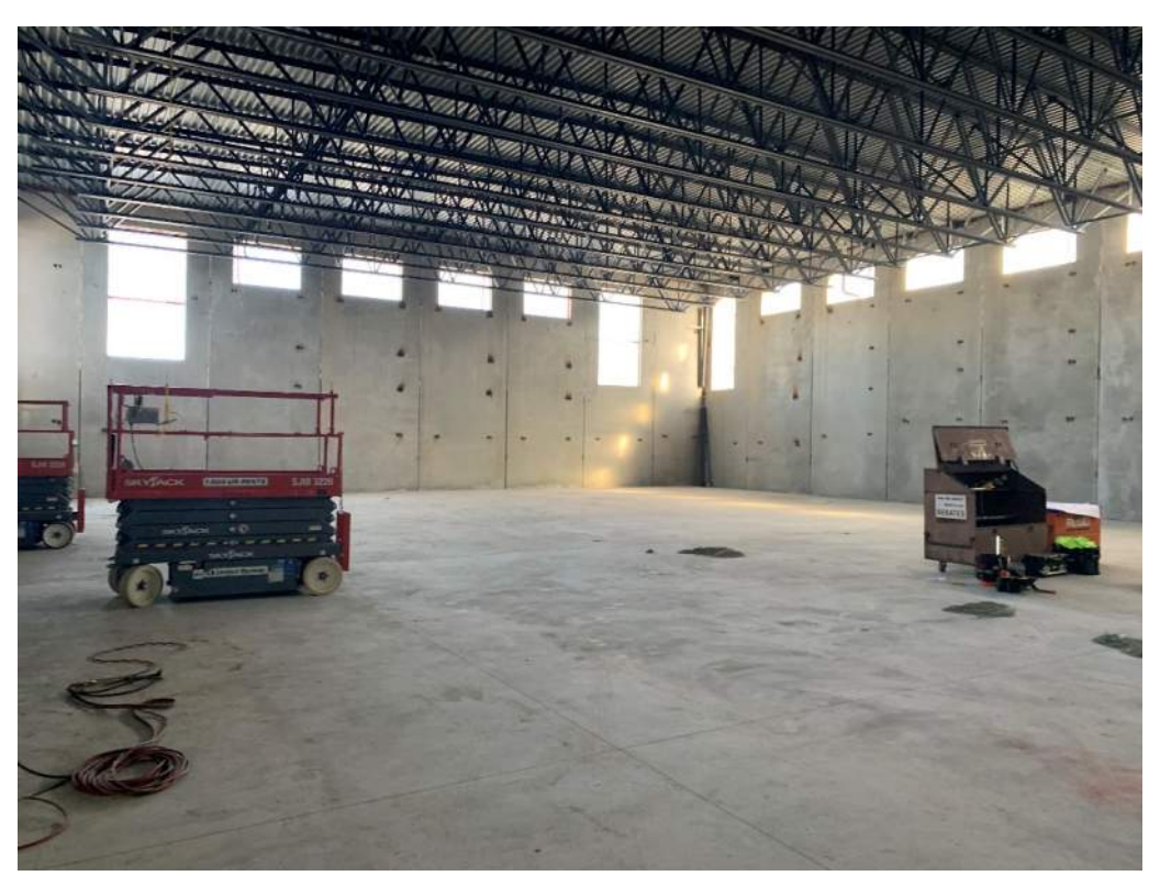
12/22/20 - Interior of Gym