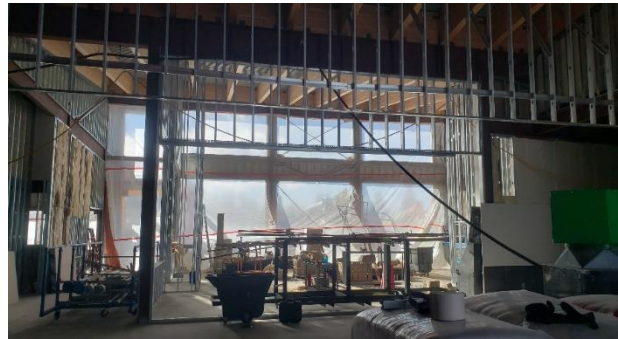
MAIN ENTRANCE INTERIOR FRAMING