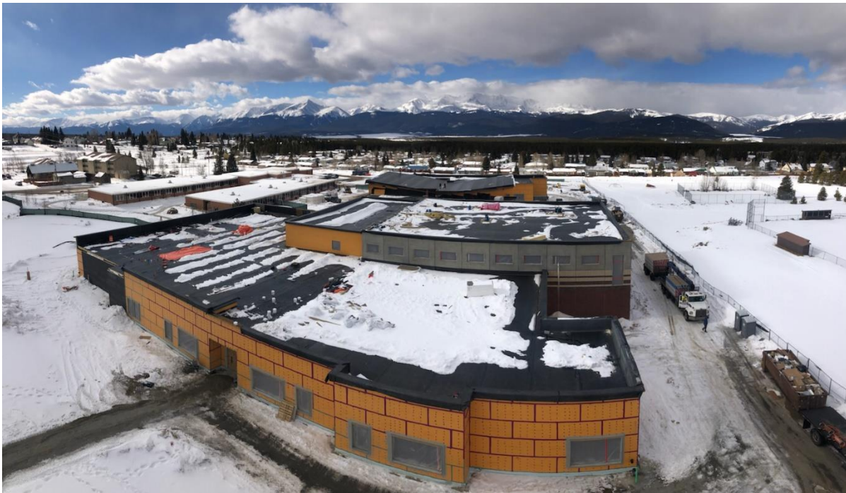
SITE CAPTURE #19