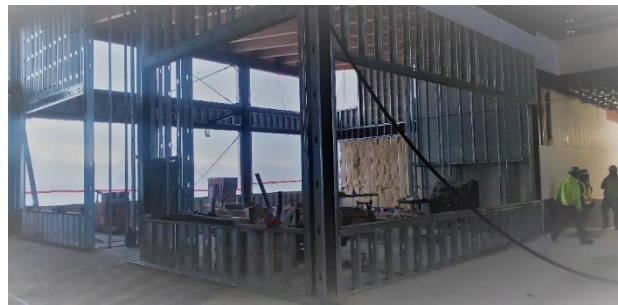
MEDIA CENTER FRAMING