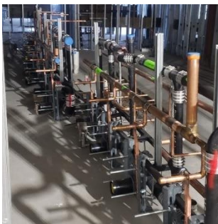
GANG RESTROOMS PRE-FAB PLUMBING