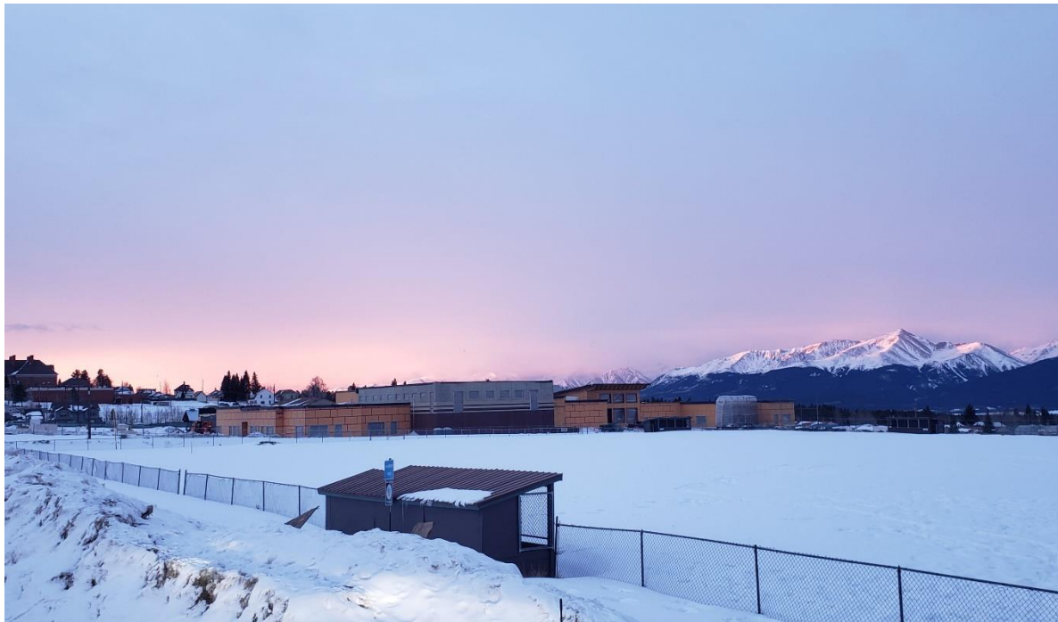
SITE CAPTURE #20