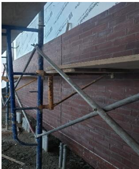
BRICK VENEER @ UTILITY YARD