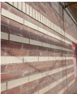
BRICK ACCENT BANDS