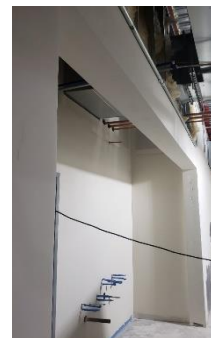
WATERING HOLE @ CORRIDOR H130