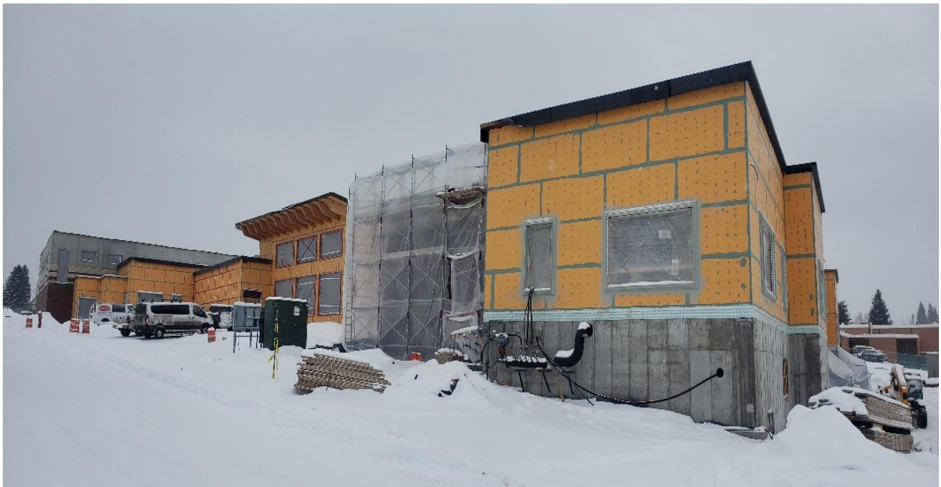
SITE CAPTURE #21