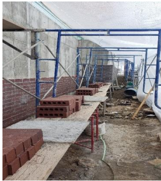
BRICK VENEER BASEMENT LEVEL