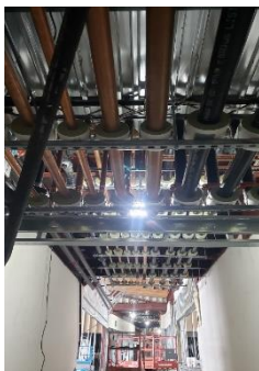
RACK SYSTEM @ CORRIDOR H130