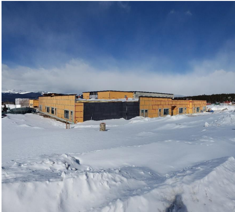
SITE CAPTURE #24