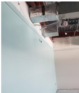
AREA A CLASSROOM PAINTING