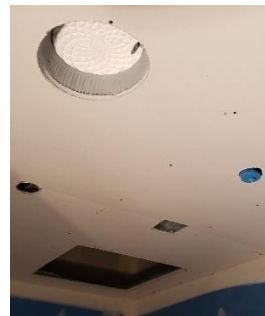
HARD-LID DRYWALL INSTALL