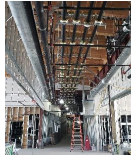
RACK SYSTEM @ CORRIDOR H 130