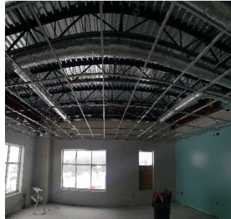
GRID IN CLASSROOM