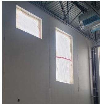
GYM WALL PRIMING