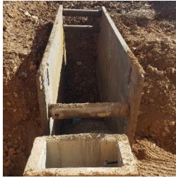
STORM SEWER RE-LOCATE @ ADDITION