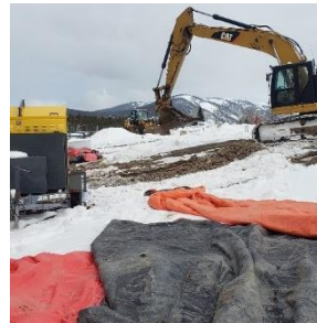
GROUND THAWING @ ADDITION