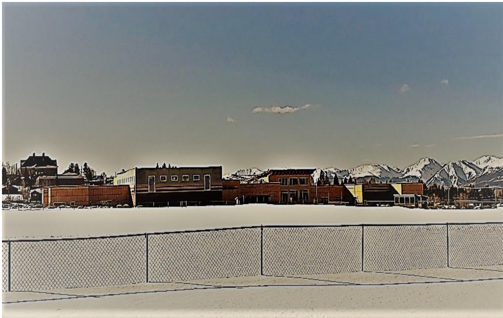
SITE CAPTURE #27