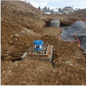
STORM SEWER RE-LOCATE @ ADDITION