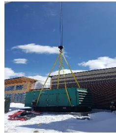
BACK-UP GENERATOR SET