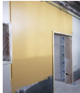
ECE ACCENT PAINT