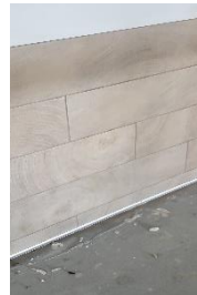
GROUTED CORRIDOR TILE