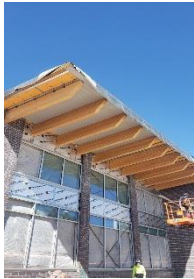
METAL PANEL SOFFIT INSTALL