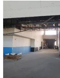
MAIN ENTRANCE CORRIDOR