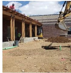
SUB GRADE PREP @ OUTDOOR LEARNING