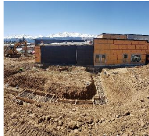
ADDITION FOUNDATION FORMING