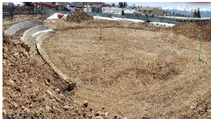
ECE PLAYGROUND SUB GRADE PREP