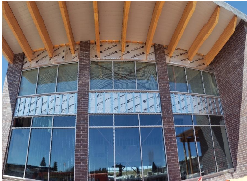
SITE CAPTURE #30