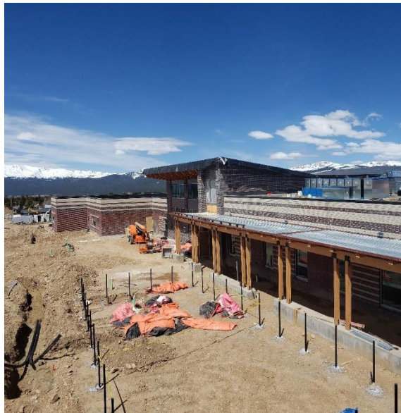
SITE CAPTURE #34