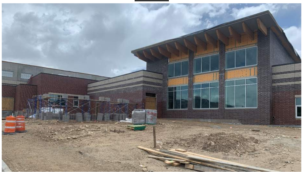
6/1/2021 - Exterior of Commons