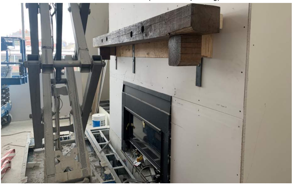
6/1/2021 - Media Center Fireplace Mantel