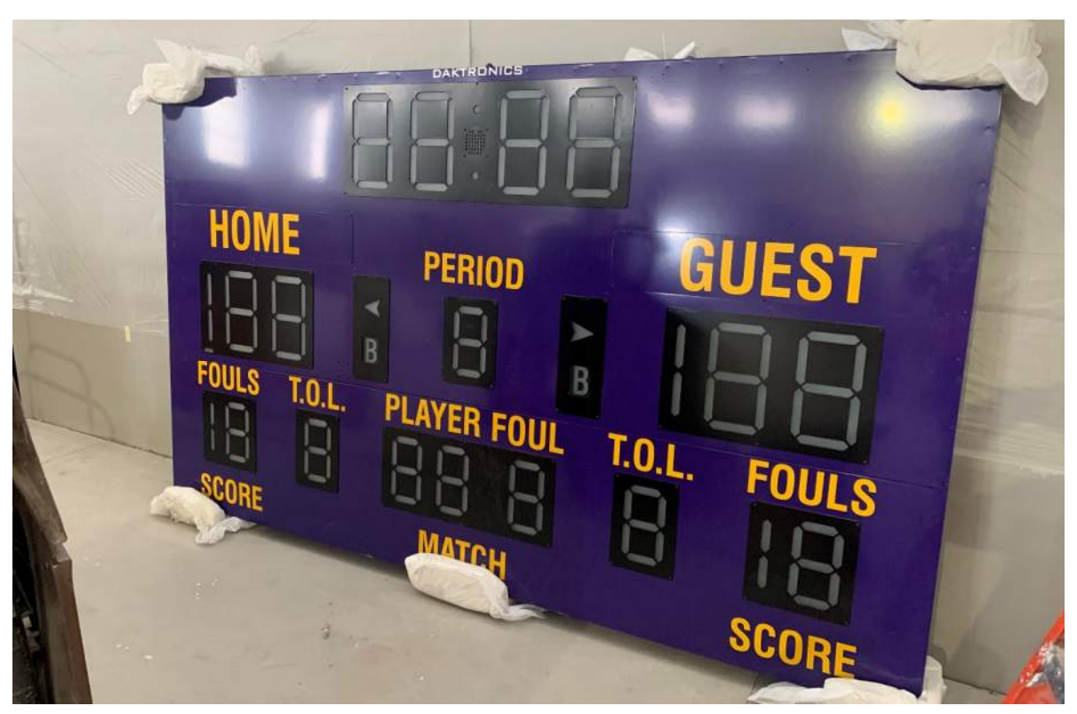
6/1/2021 – Scoreboard (installation upcoming)