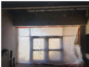
CANOPY ENTRANCE STOREFRONT