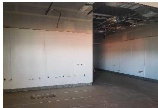
FRP IN KITCHEN