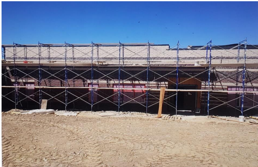
SITE CAPTURE #37