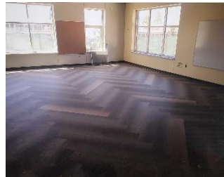
LVT PLANK IN ECE CLASSROOM