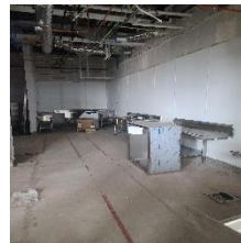
KITCHEN EQUIPMENT INSTALL