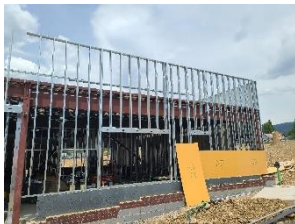
ADDITION INTERIOR/EXTERIOR FRAMING