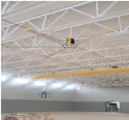
BIG #@$@ FAN