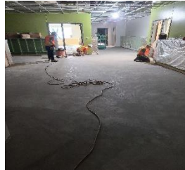
AREA A CORRIDOR FLOORING