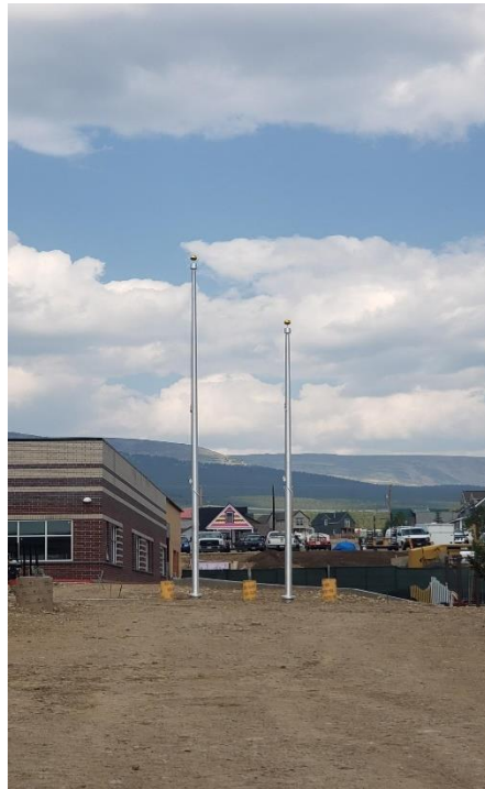
SITE CAPTURE #41